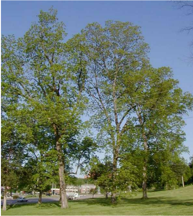
Pecan Carya illinoensis