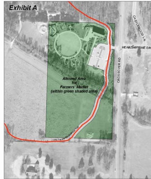
Farmers' Market at Lake Fayetteville Park within Botanical Garden leased area 1 inch = 150 feet

(B) Exemptions. The City's regularly licensed concessionaires acting pursuant to the authority and regulation of the City are exempt from subsection (A). Nonprofit organizations which have obtained a special events permit may sell nonalcoholic beverages and food during an annual event. Gulley Park Concert sponsors may sell food and nonalcoholic beverages during the concerts when specifically permitted by the Parks and Recreation Department Director. The Farmers' Market and its members may sell items allowed pursuant to §114.02 (C) of the Fayetteville Code on Sundays within a portion of Lake Fayetteville Park that is licensed to the Botanical Garden Society of the Ozarks (if approved by the Society) as shown on Exhibit 'A'.