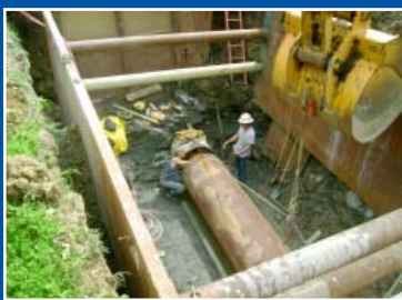
WL-2 Sycamore Tunnel