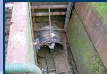
WL-4 I-540 Tunnel