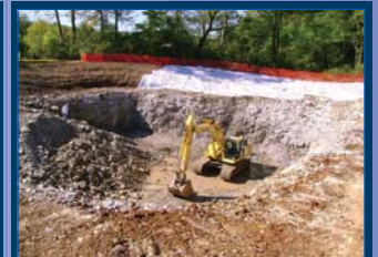
WL-6 Hamestring Lift Station