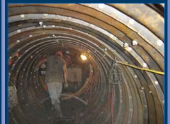
WL-4 I-540 Tunnel