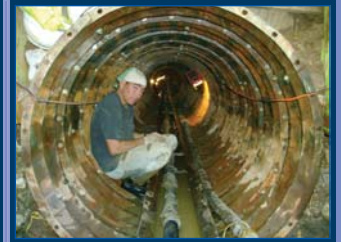
WL-1 Old Missouri Tunnel