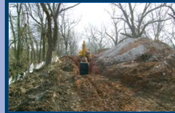
WL-2 North Drake BEFORE