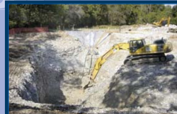
WL-6 Hamestring Lift Station