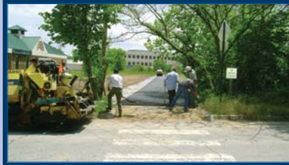
WL-1 Front St. Enhancing Trails