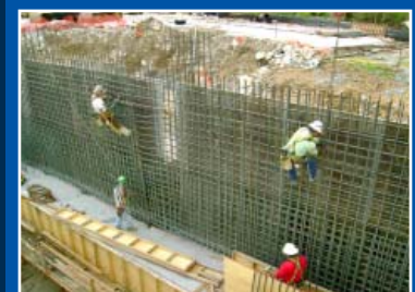
WL-6 Hamestring Lift Station