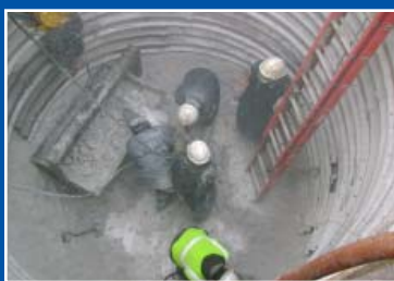
WL-4 Mount Comfort

The Wastewater System Improvement Project (WSIP) is a system wide project that significantly increases the capacity of the City of Fayetteville's wastewater system. The project addresses capacity shortfalls in the wastewater collection and treatment systems; the design is expected to treat the wastewater for 115,000 people.