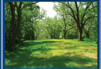
WL-2 North Drake AFTER