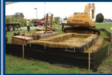
WL-1 College Ave. Filter